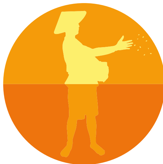
WOMEN ON AVERAGE MAKE UP ALMOST HALF THE AGRICULTURAL LABOUR FORCE IN DEVELOPING COUNTRIES