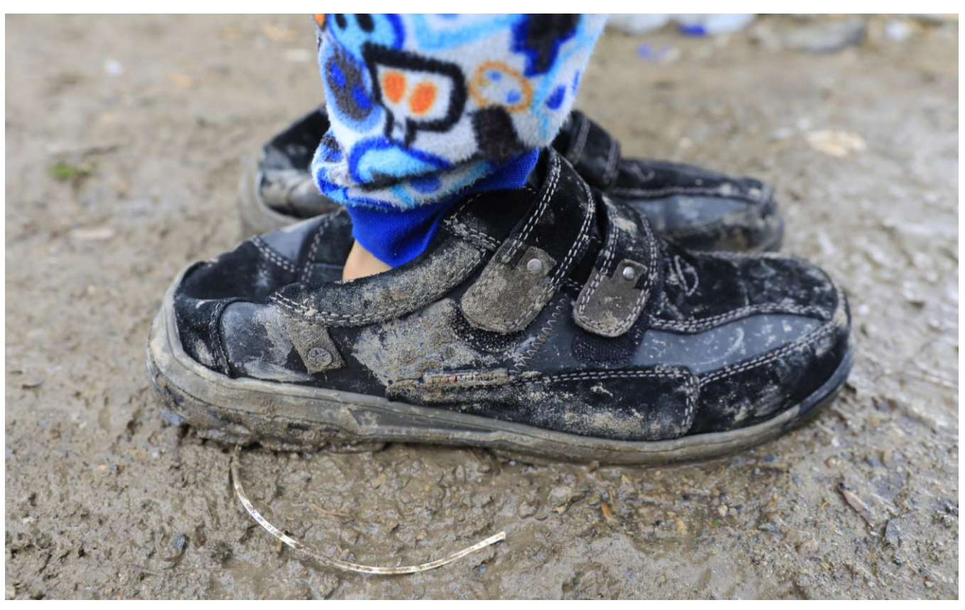
A child stands outside of his family tent in the rain in an area just outside Moria Camp known as the olive grove or 'jungle'.