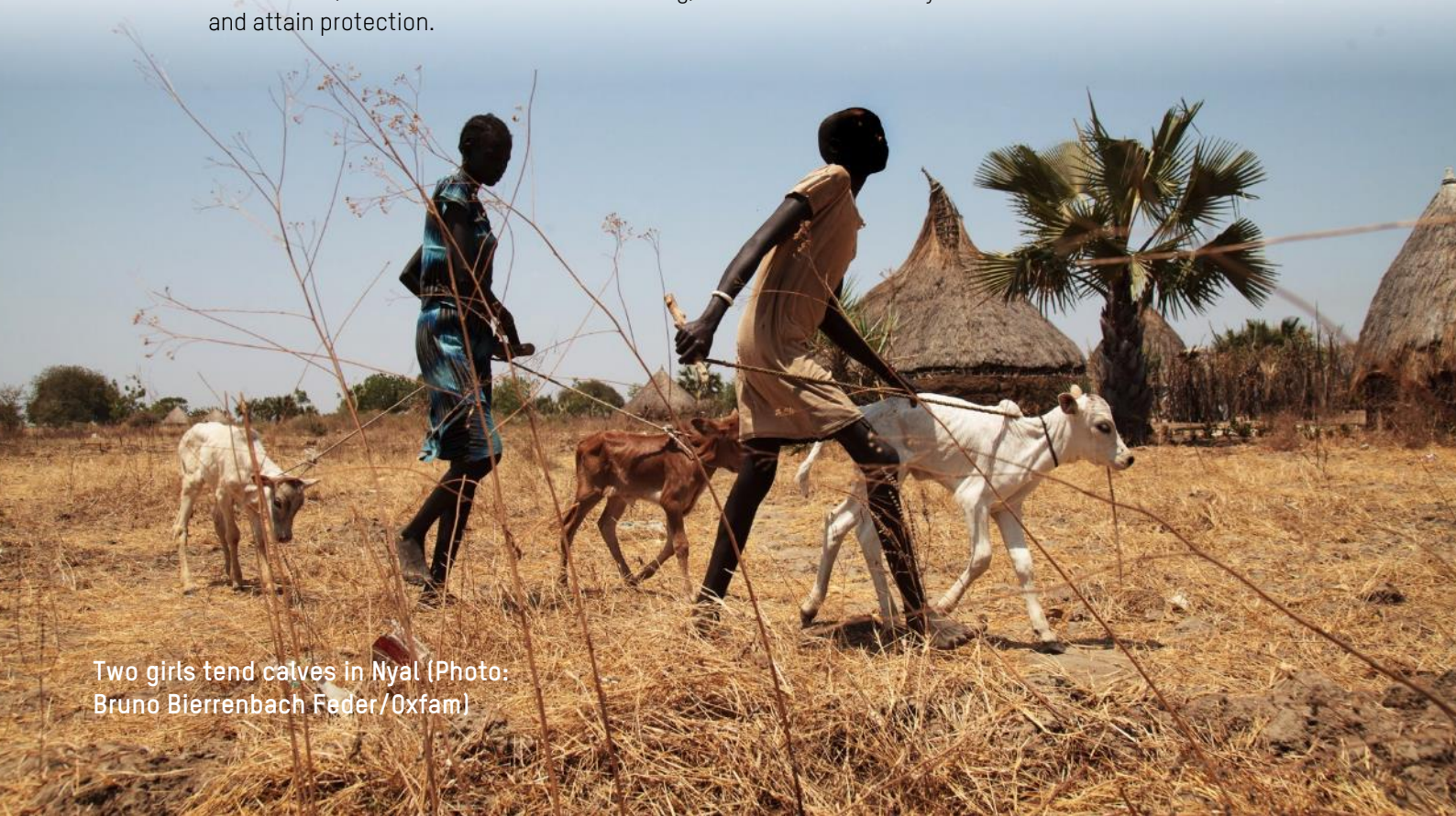
Two girls tend calves in Nyal

Previous research has demonstrated that once married, girls in South Sudan are often socially and physically isolated from their friends and family and forced to rely completely on their husband and in-laws for emotional support and basic needs. 32 In these relationships, women and girls frequently lack influence and decision making power, which can have a profound effect on their mental, emotional and social well-being, as well as their ability to seek and attain protection.