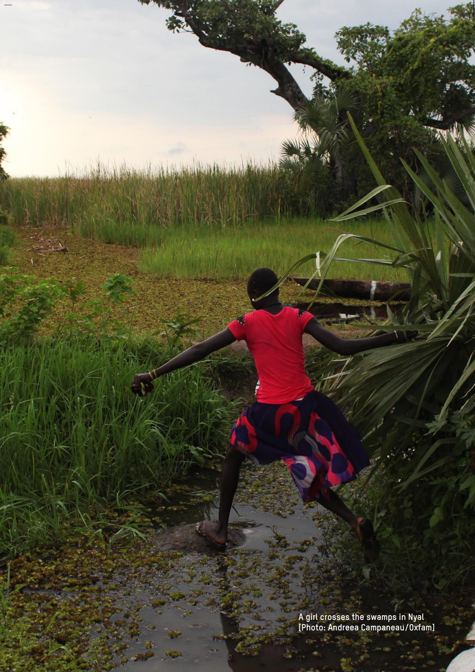
A girl crosses the swamps in Nyal