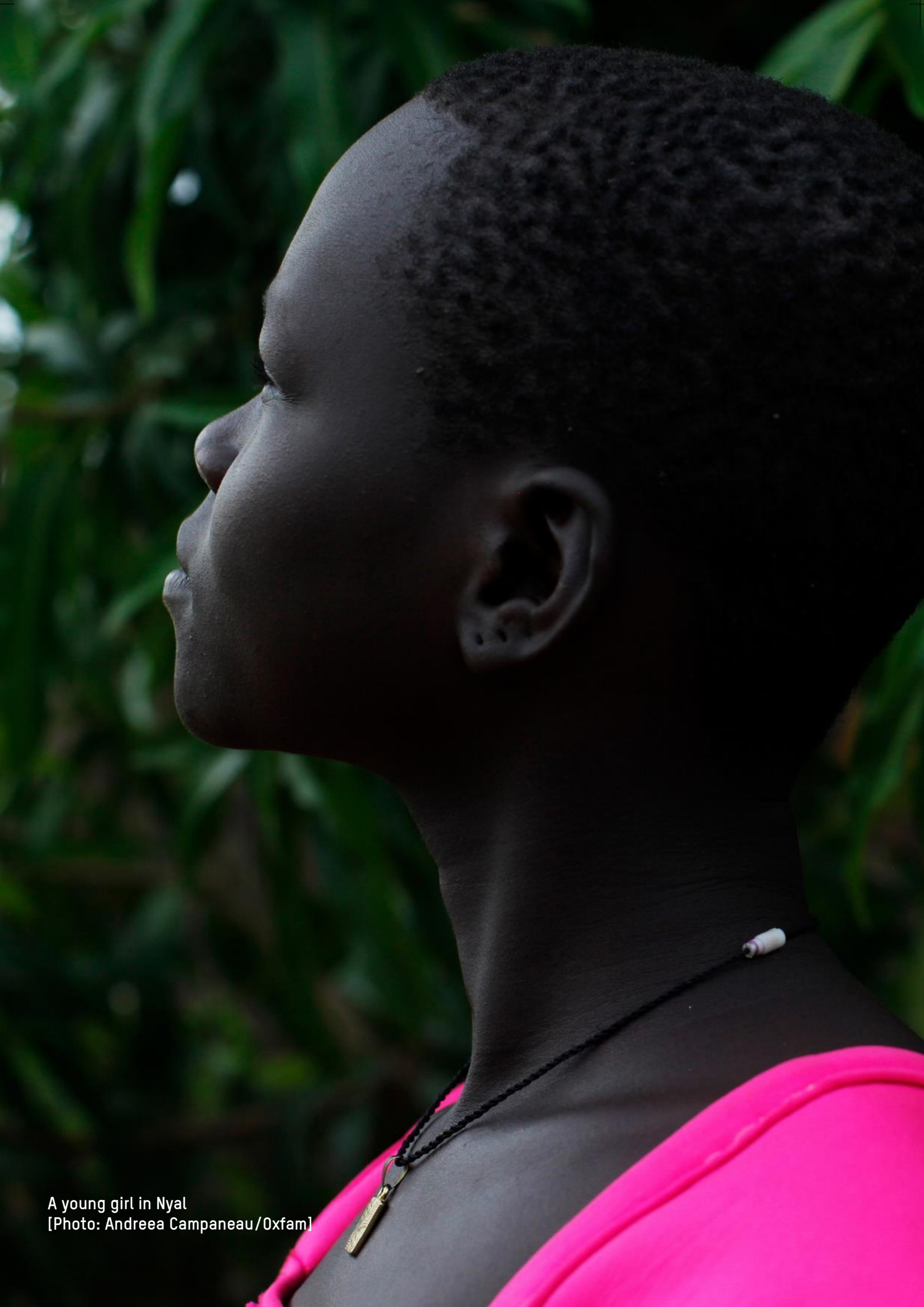
A young girl in Nyal