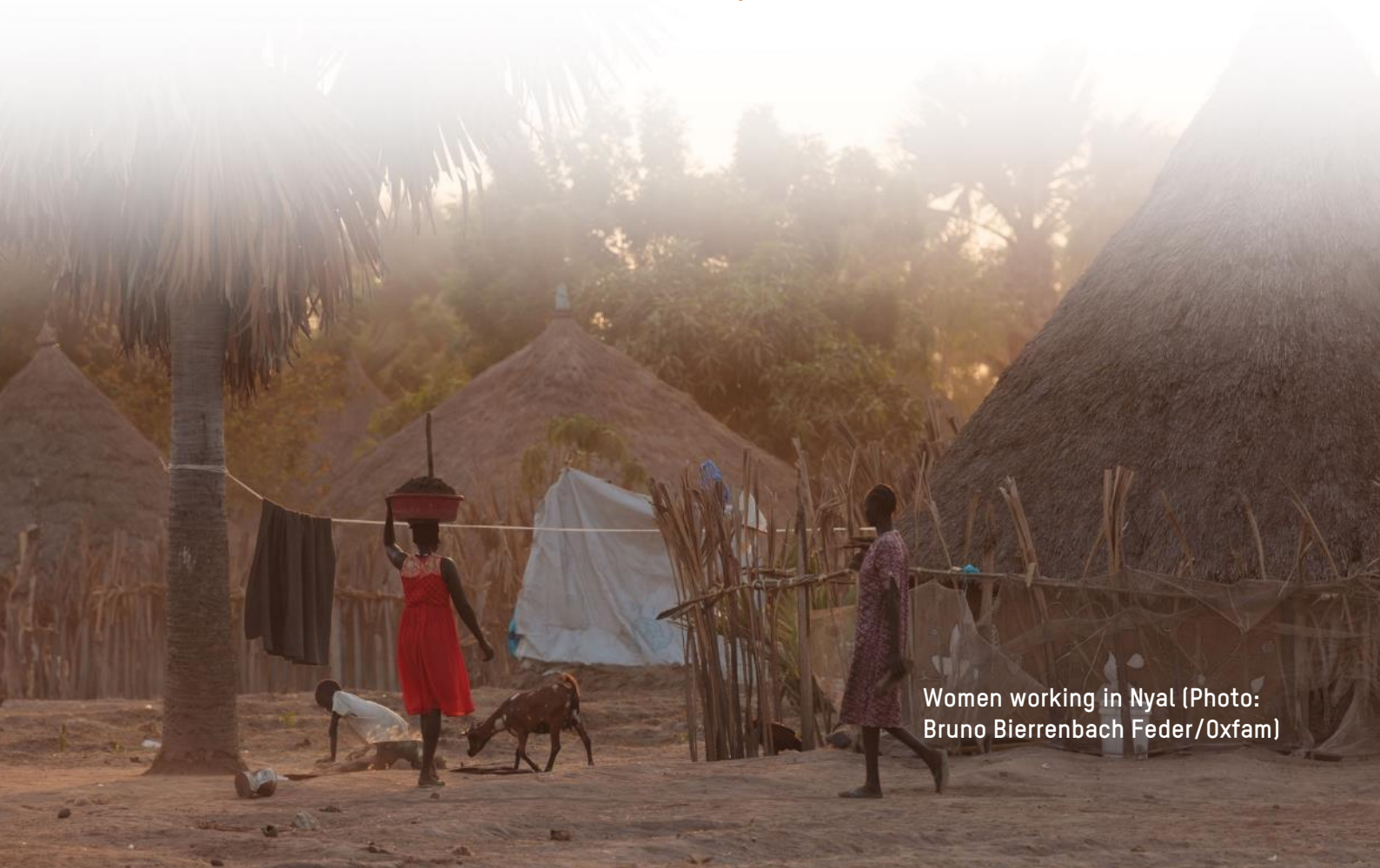
Women working in Nyal

Interview with male staff member of national NGO, Nyal