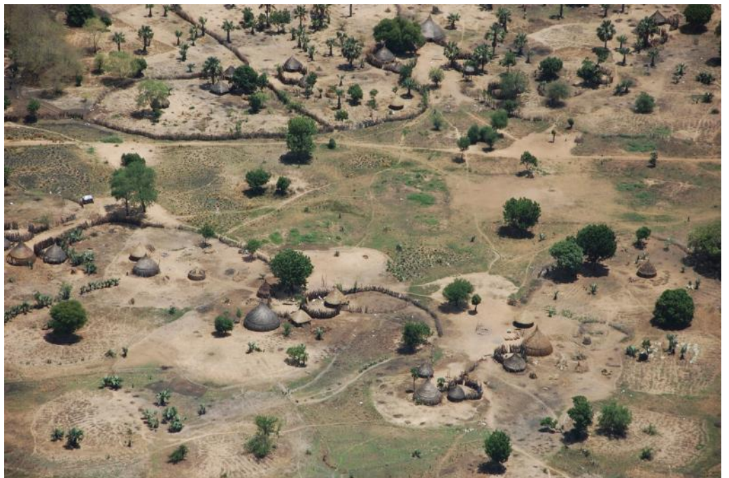
Nyal, Panyijiar County, South Sudan

While certain cultural factors continue to drive CEFM, people repeatedly noted that the conflict has affected the way that marriage, and its role in society, is perceived. Specifically, CEFM is seen as a coping mechanism amid rising poverty and food insecurity, and