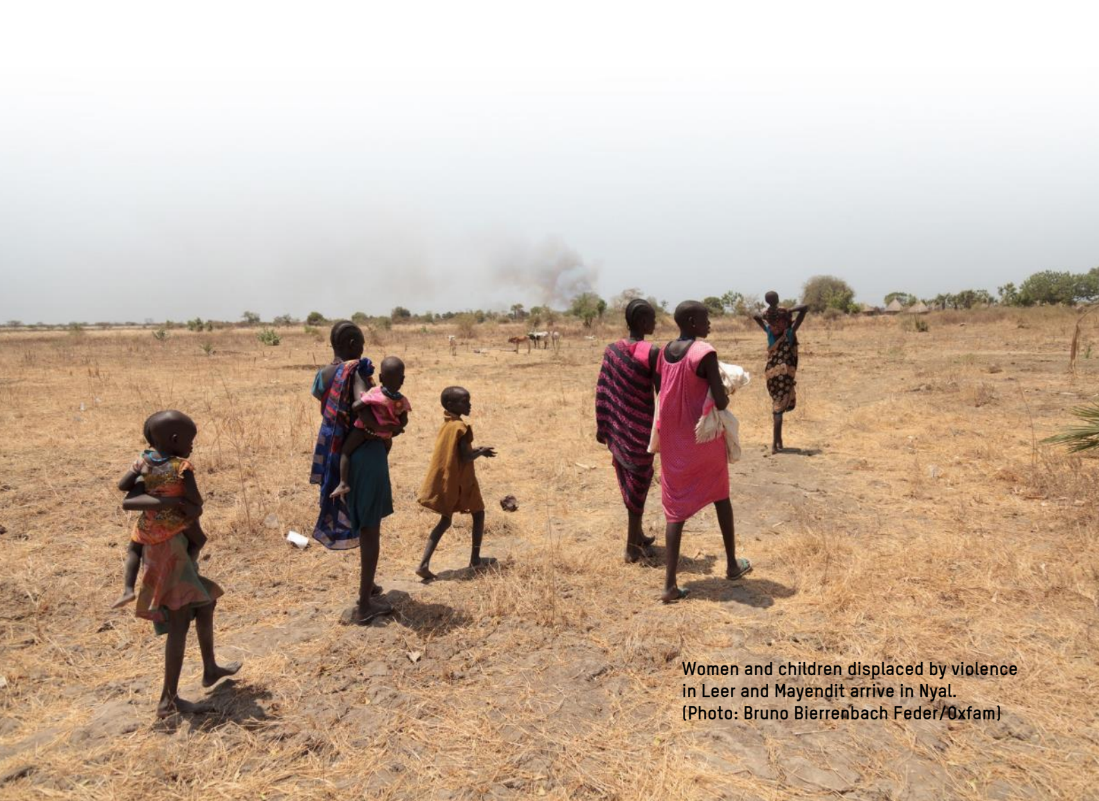
Women and children displaced by violence in Leer and Mayendit arrive in Nyal.

While Oxfam's research was not able to determine if the rates of CEFM are increasing in Nyal as a result of the conflict, anecdotal evidence from other sources suggests this may indeed be the trend in South Sudan. In Nyal, community members spoke of how the dynamics and driving forces behind the practice have changed since the conflict started in 2013. Conflict-fuelled poverty and food insecurity are now considered to be the most common reasons for families to marry off their young daughters. Additionally, girls displaced by conflict were considered at greater risk of being married before 18. The increased threats of sexual violence and breakdown of rule of law – including respect for traditional authority and customs – were also linked to CEFM in Nyal. While the signing of a peace deal in September provides some hope that the situation in South Sudan may improve, the conditions that have exacerbated girls' risk of CEFM remain. Recovery will be gradual and will require sustained peace and substantial investment.