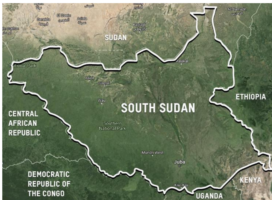
Map of South Sudan