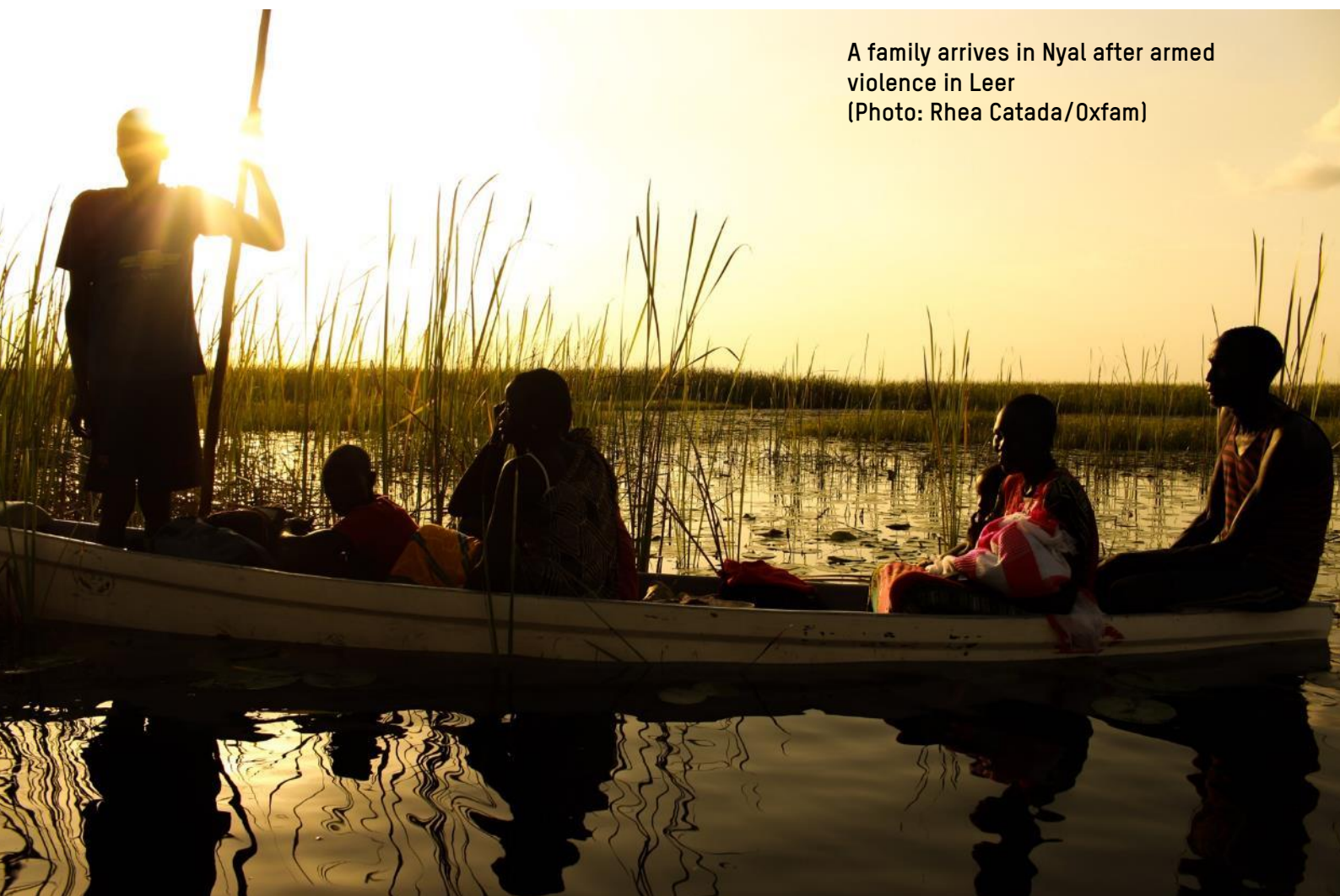
A family arrives in Nyal after armed violence in Leer

Interview with male community member working with national NGO, Nyal