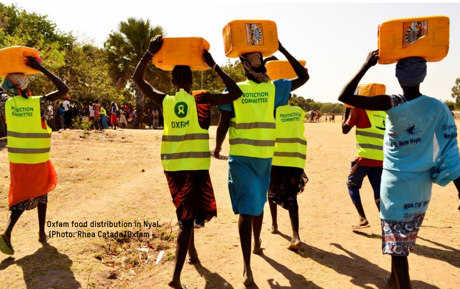
Oxfam food distribution in Nyal.

Five years of conflict means that more than half the population in South Sudan face starvation: as of September 2018 (the end of the lean season), 6.1 million people were severely food insecure. It will take years for South Sudanese people to recover and rebuild their lives and livelihoods. As already noted, rising hunger and poverty, driven by the conflict, have had detrimental consequences for many girls who have been pushed into early or forced marriage.