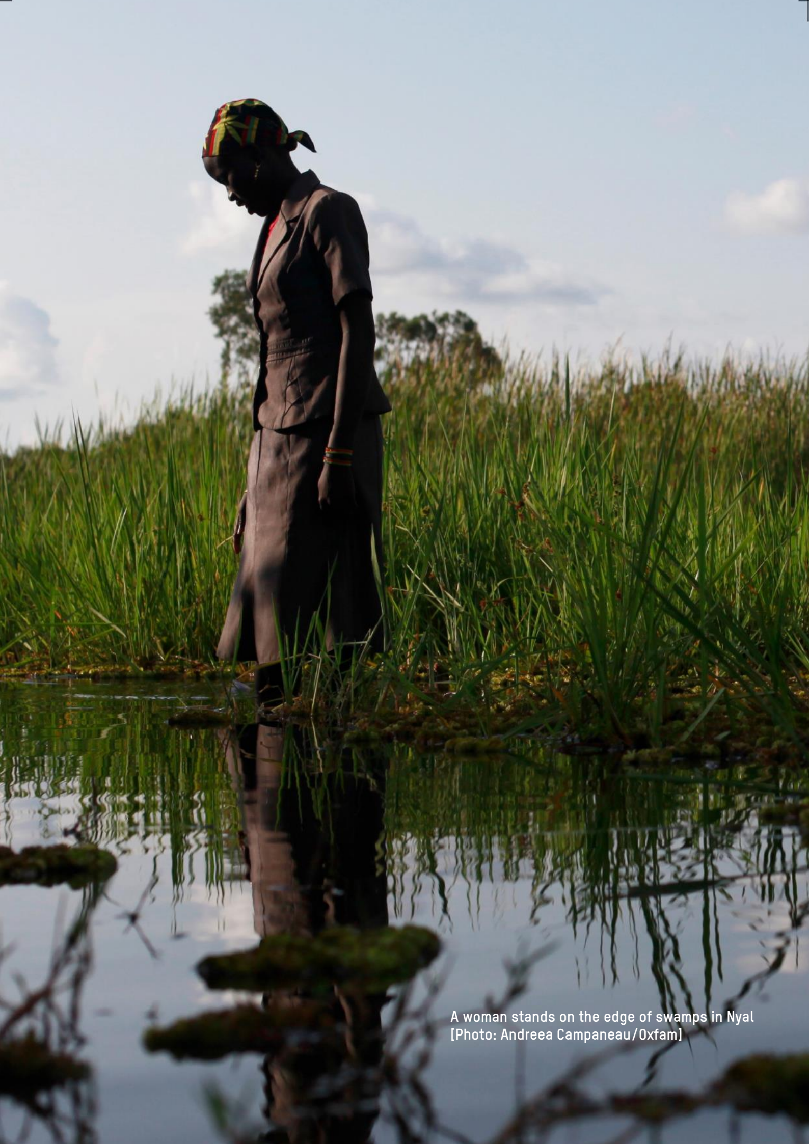
A woman stands on the edge of swamps in Nyal